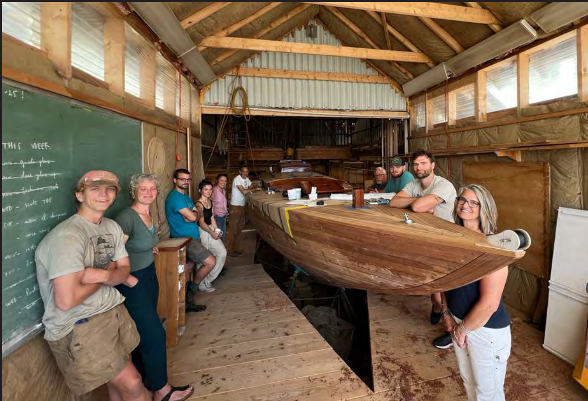
Proud apprentices finishing off Dublin Bay 24 Zephra in Maine, USA.