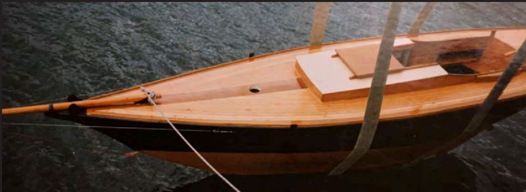
Eithne c. 1975

I get great pleasure in watching and working with ship wright trainees in the international marine maker schools we work with, listed below, and hope one day to work with them to establish a Dublin version as part of a new initiative to promote Dublin's rich Maritime heritage.