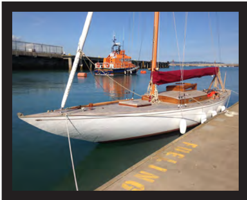
Dublin Bay 24

I first visited the French boat building school Skol Ar Mor in Brittany France in 2010. Since then they have produced a Periwinkle, a SOD, a couple of Water Wags, a Howth 17 two gorgeous rowing boats and a Beetle Cat, eight boats in all now from Skol Ar Mor for Irish customers. And our Spanish and USA School friends are now building more Water Wags for Ireland.