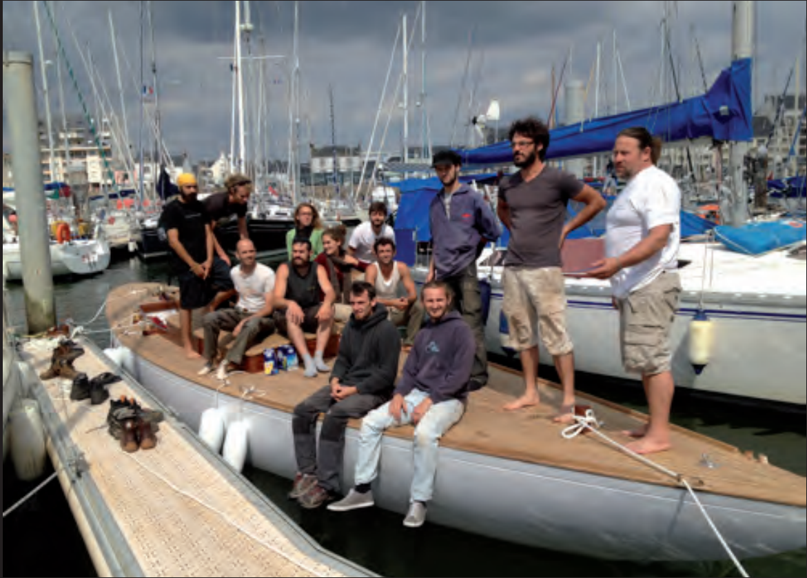
Proud apprentices who rebuilt Dublin Bay 24 Perriwinkle in Brittany, France.