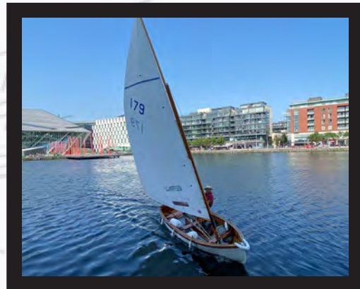
Shannon One Design