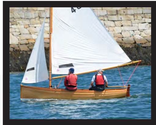
French School Water Wag